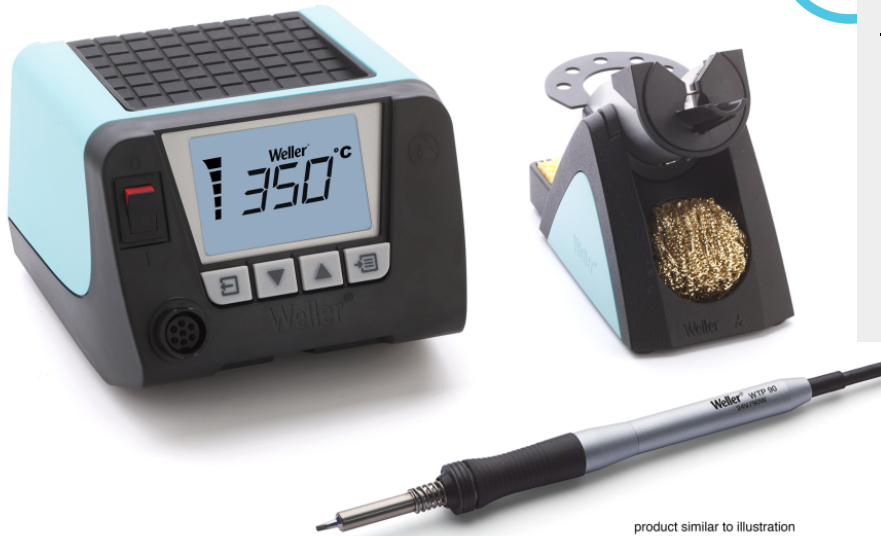
product similar to illustration