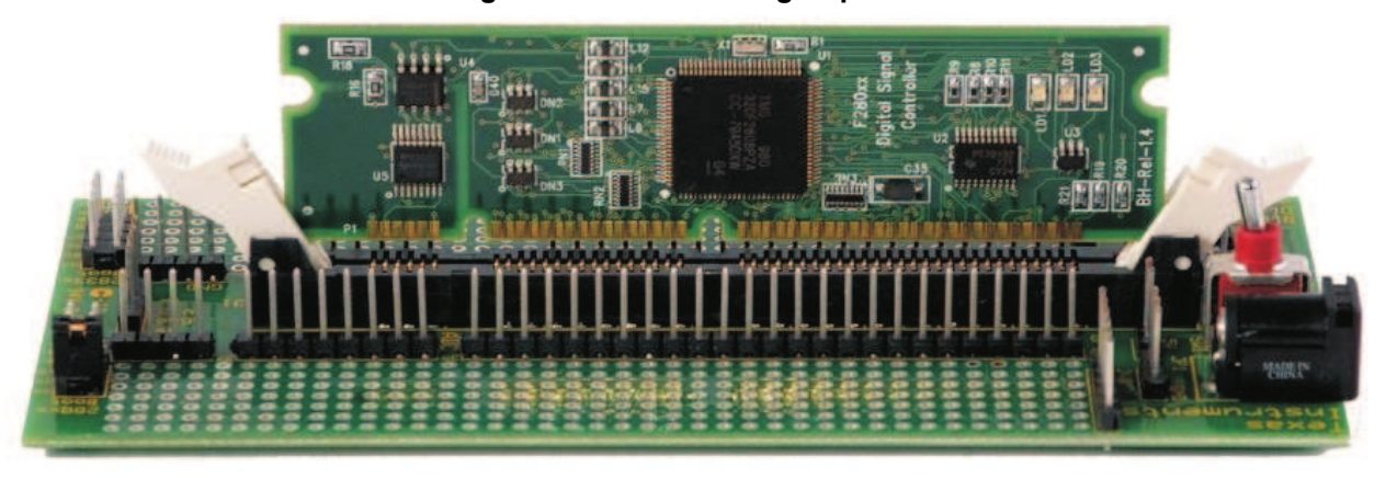
Figure 2. Card Retaining Clips