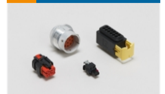
Automotive, Truck, Bus, & Off-Road Housings(241)