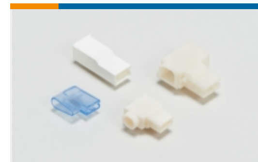
Crimp Terminal Housings(13)