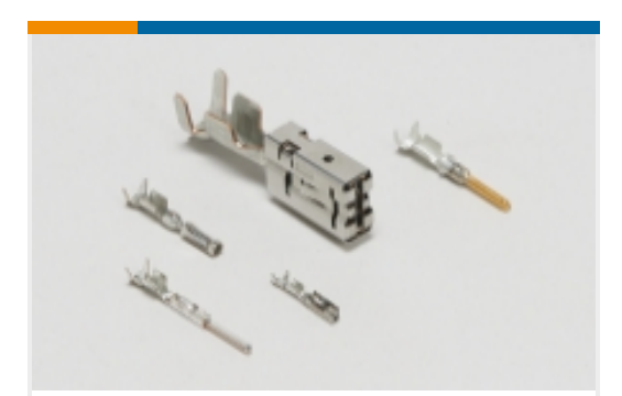
Automotive, Truck, Bus, & Off-Road Terminals(149)