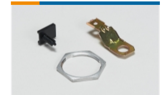
Other Automotive Connector Accessories(2)